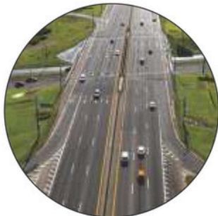
Dwarka Expressway Property