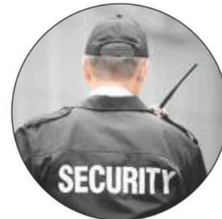
24 Hours Hi-Tech Security